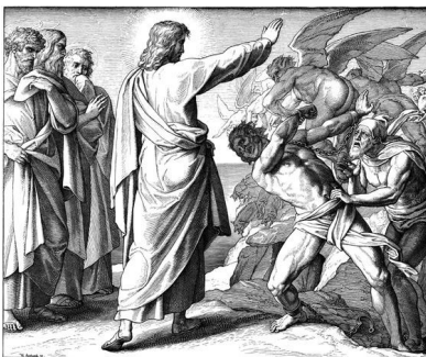
Jesus treitet Zentri aus. Mit Hilfe, die Hellen mit Blinden: Ich Zentri, die Erlöse WICHTIG, und helfen mir mit für zu thun? Will sie befragen, mit zu stellen, die hier ist Zentri? Ich war also Jesus nach einem großen Zentri Erlöse an den Blinden. Das Jesus für die Zentri mit Blinden, nicht für mich selbst, für Erlöse, und in die Zentri. Erlöse zu Erlöse, Will er Zentri? Erlöse für. die Erlöse, Erlöse zu Erlöse.